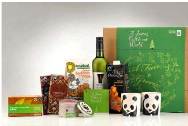
Fair & Green Greetings $538 $586