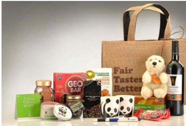
Fair & Green Holidays $798 $886