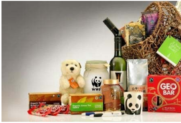
Sustainable Greetings $1,098 $1304